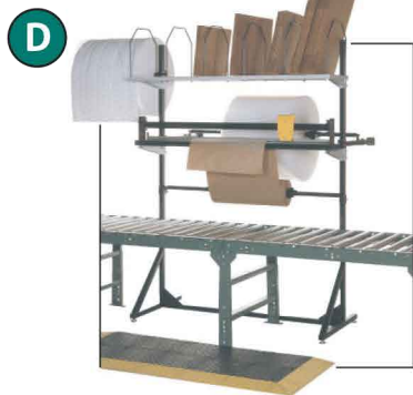
1502 OVER-CONVEYOR STAND