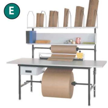
PBS-911 FULL FUNCTION BENCH

(800) 849-3852 • ASKIPC.COM Save SPACE • STORAGE • HANDLING • DESIGN • ERGONOMICS