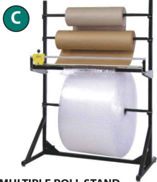
MULTIPLE ROLL STAND