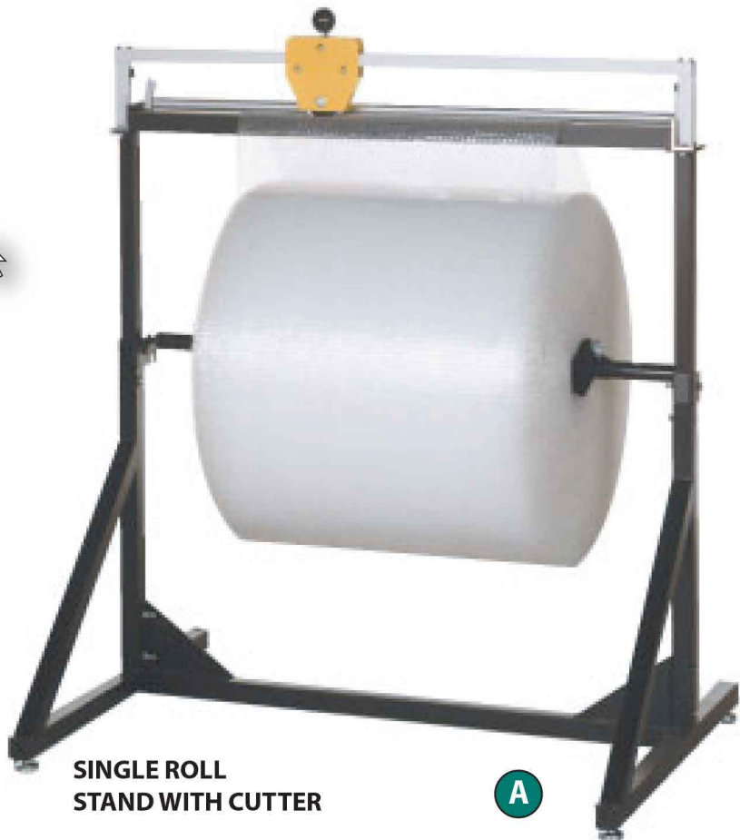
SINGLE ROLL STAND WITH CUTTER