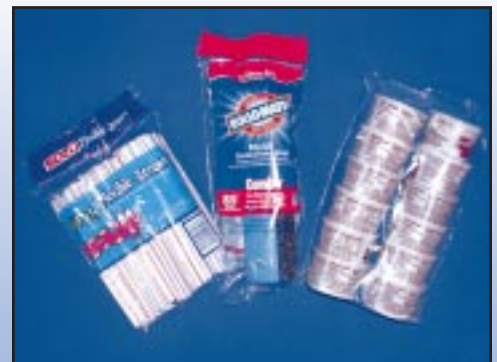
Bagmasters and Drop-sealers™

The Titan™ Drop-Sealer and Bag-Master™ Equipment is used whenever a complete wicketed bag opening, filling, trim and seal is required to significantly increase the output over manual hand loading of bags.