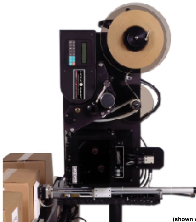
(shown with special application)

Labels that require high quality bar code, text, and graphic images